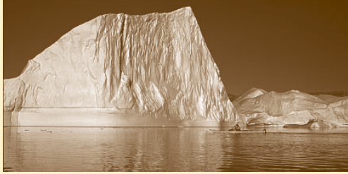
Kayaking amongst Greenlandic icebergs

In August and September 2004, we've introduced two new 14-day voyages, combining East Greenland and Spitsbergen. As well as exploring the harsh and dramatic Greenland coast, each voyage includes two to three days in western and northern Spitsbergen, enjoying tundra hikes and keeping an eye open for polar bears, walrus and Svalbard reindeer.