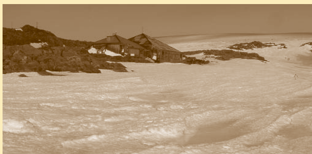
Mawson's Hut, at the windiest place in the world

The Mawsonettes then circumnavigated the rocky outcrop to find where the cliffs met the bay. Around the ragged rocks we ran, past protesting Adélies, to see the magnificent ice cliffs meet the blue waters. So overwhelming, we could almost reach out and embrace their jagged faces. We lingered long in this lovely place.