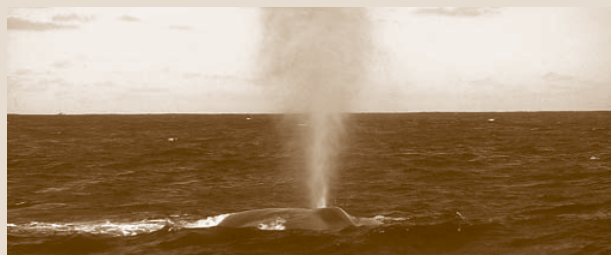
Blue whale letting off steam

Blue whales arrive in November–December from tropical wintering grounds and depart in May. A maximum of 47 have been sighted from the air. Krill distribution changes daily, and blue whales constantly search for the densest aggregations and then attack in spectacular feeding lunges. Krill abundance also attracts fin and sei whales, dolphins, seabirds, seals, tuna and squid, making this one of Australia's richest marine ecosystems.