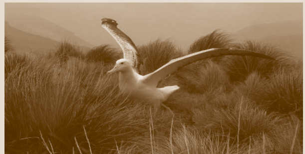
Royal albatross at Campbell Island prepares for takeoff

Following ratification by five nations including Australia, the Agreement on the Conservation of Albatrosses and Petrels came into force on 1 February 2004. Twenty of the world's 24 species of albatrosses are considered endangered, with some threatened with immediate extinction. Loss of habitat and interaction with long-line fishing operations are major threats. In January, Ladbroke's Big Bird Race was announced, allowing bets on the progress of eighteen Tasmanian shy albatrosses during their five month 6,000 mile pilgrimage from Tasmania to South Africa. Electronic tags will provide both scientific and wagering data. Profits will fund seabird conservation projects.